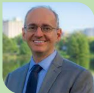
Scott Randolph (D) Orange County Tax Collector