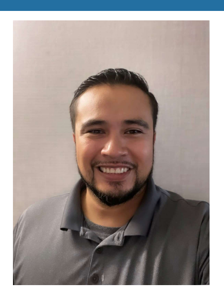
Milton Castellanos Hyatt Place Orlando IDrive/Convention Center